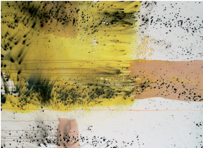
Beauty is rarely worn on the outside 120 x 150 cm, ink on paper, 2008

We now know that the social originates in the material imagination. Without it, the social cannot exist.