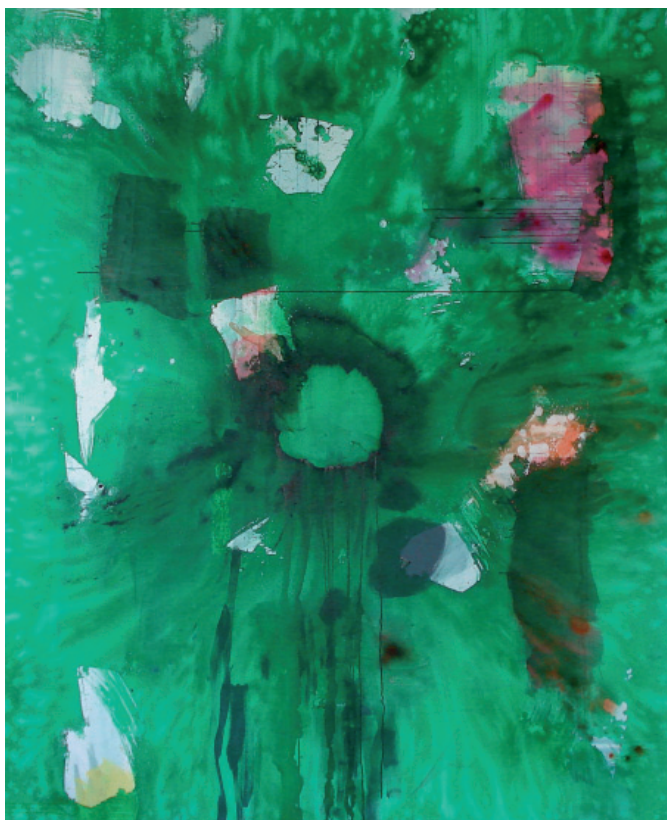
Black Flower 280 x 230 cm, canvas, 2007

Of course one recognizes in Bachelard's use of the term, correspondences, a triple set of allusions and their philosophical associations central to modernism – Baudelaire, Benjamin and Brecht.