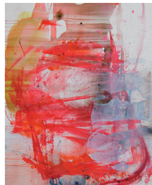
I need more grace than I thought 150 x 120 cm, ink on paper, 2007