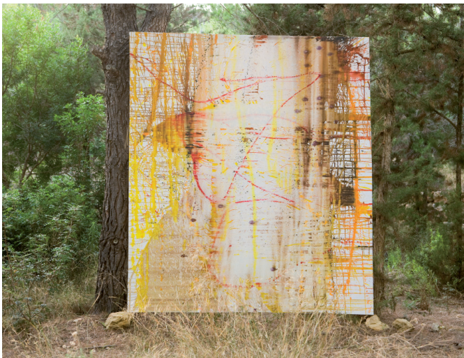
Between colour and sound 230 x 200 cm, ink on canvas, 2008

Not only has Löhr challenged the material imagination in philosophical terms, but like many before him, he has challenged his own trade through the elimination of many of its tools and material conditions – the infinite forgiveness of oil and acrylic have been replaced by the unforgiving immediacy of water color, and the durability and transmutability of canvas by the profound non-mutability of paper. If, we were to assimilate Löhr to an art history category, we would call him an actionist, but the comparison would be only minimally productive in those terms. The conditional is used here instructively to set him apart from a naïve modernity reliant as it is on naïve realism, and relate him more to Turner, in terms of an empiricist abstraction of the medium, but more to Goya in terms of the