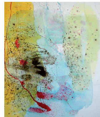
Drawing you closer 150 x 120 cm, ink on paper, 2007