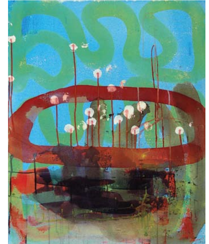
As in the play of images mixed media on canvas 76 x 60 cm 2009