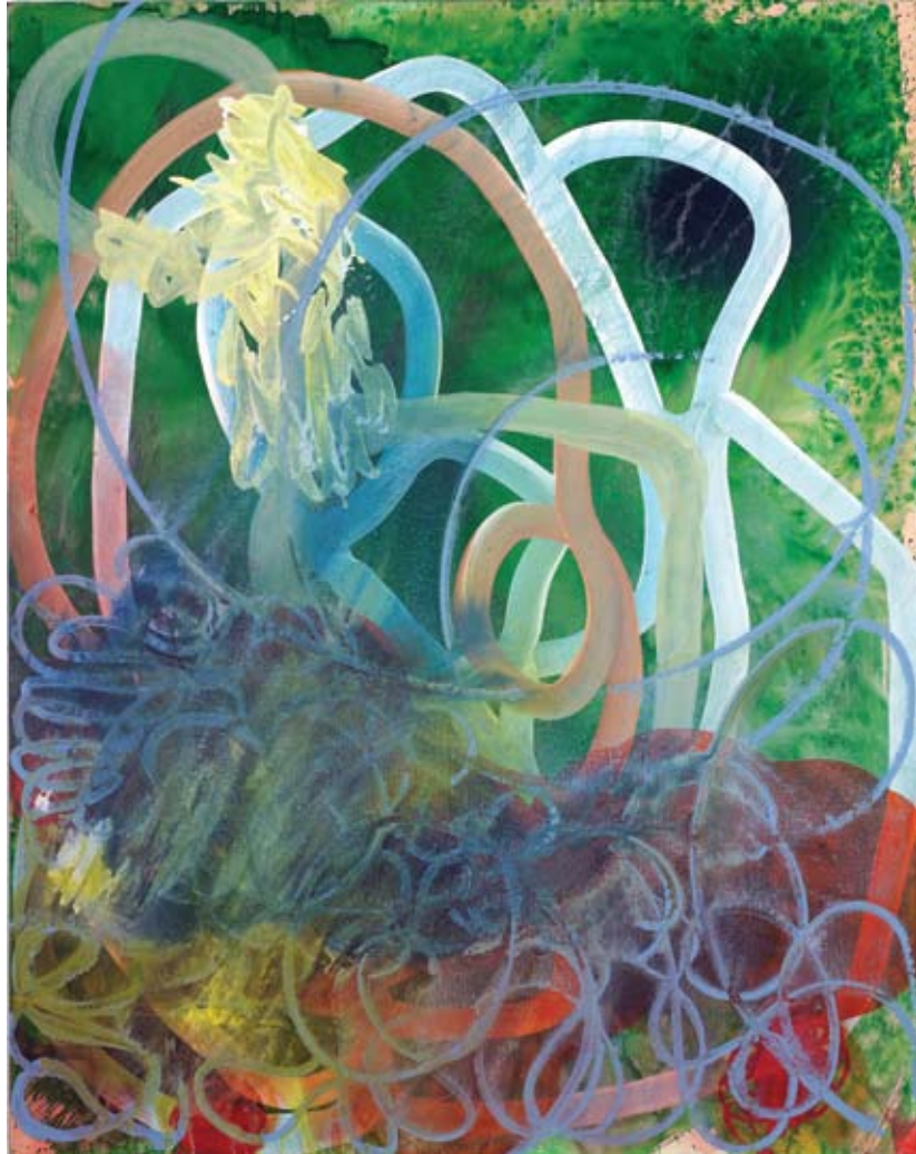
A sudden wave of silver mixed media on canvas 126 x 100 cm 2009