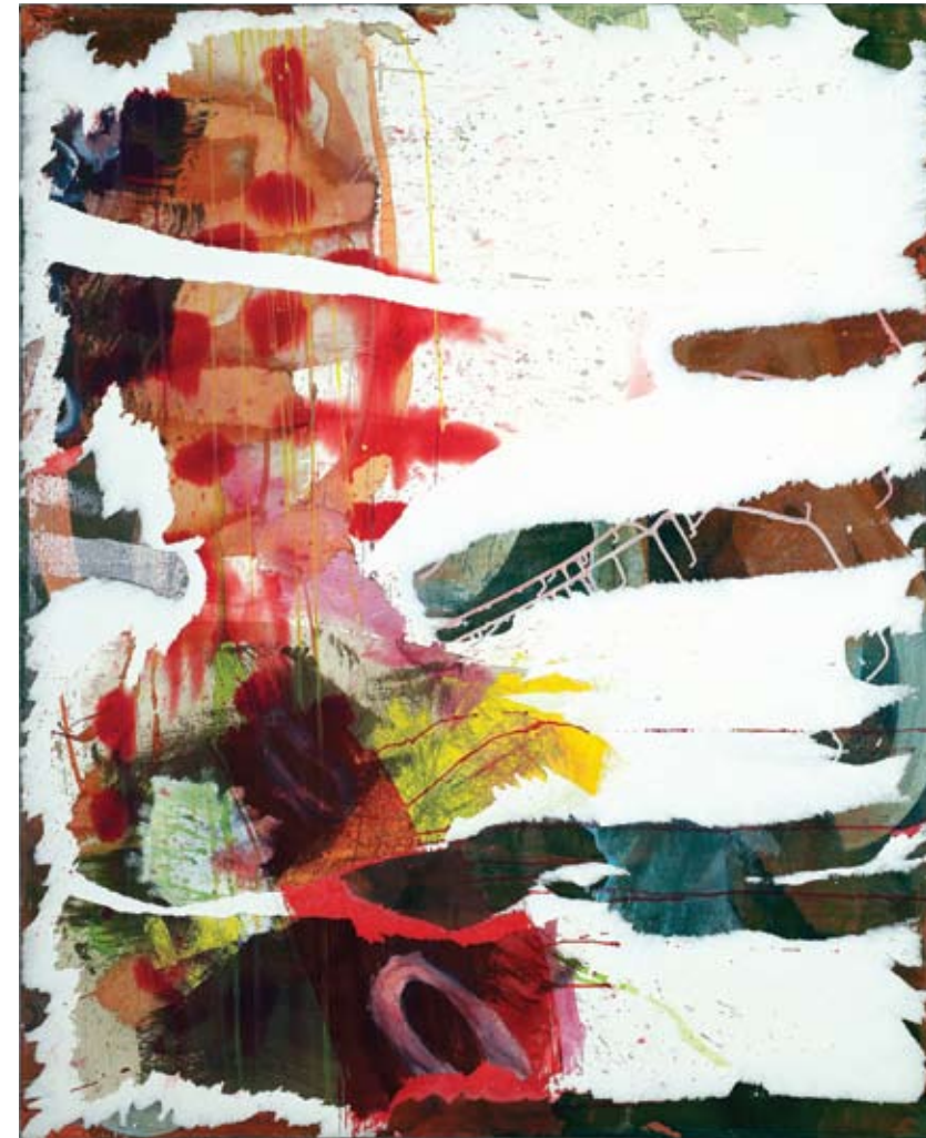
Dear Master Mathis mixed media on canvas 126 x 100 cm 2009