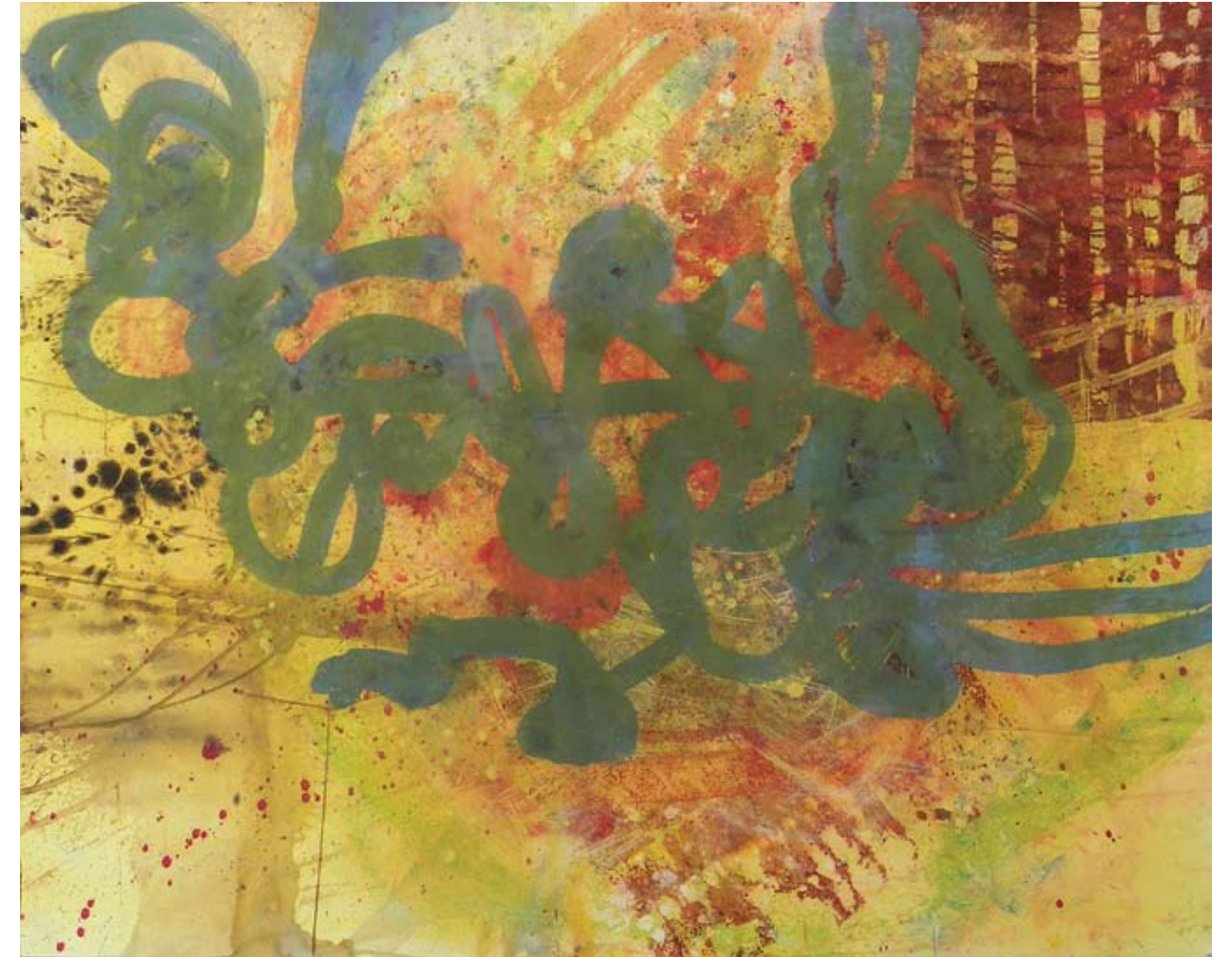
Based upon a true story mixed media on paper 120 x 150 cm 2009