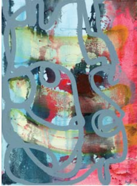
Inflections of voices now silent? mixed media on canvas 40 x 30 cm 2009