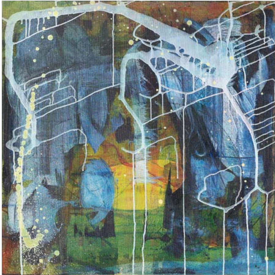
Politeness mingled with mischief mixed media on canvas 90 x 90 cm 2009