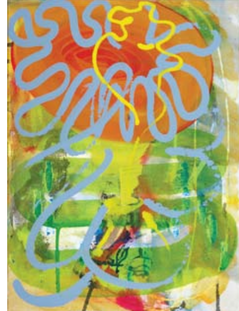
Yellow outline of her resonance mixed media on canvas 40 x 30 cm 2009