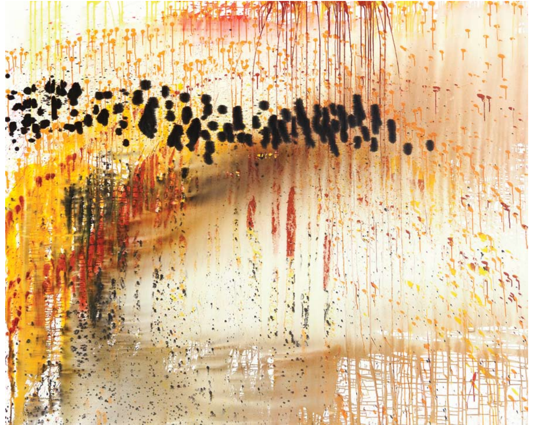
Contrary to metaphor the dawn inks are doing their dissolve mixed media on canvas 180 x 220 cm 2009