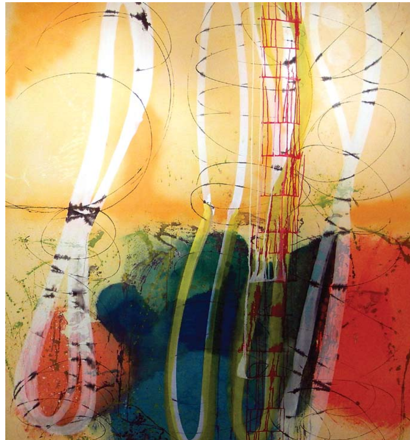
An inner likeness mixed media on canvas 230 x 200 cm 2008