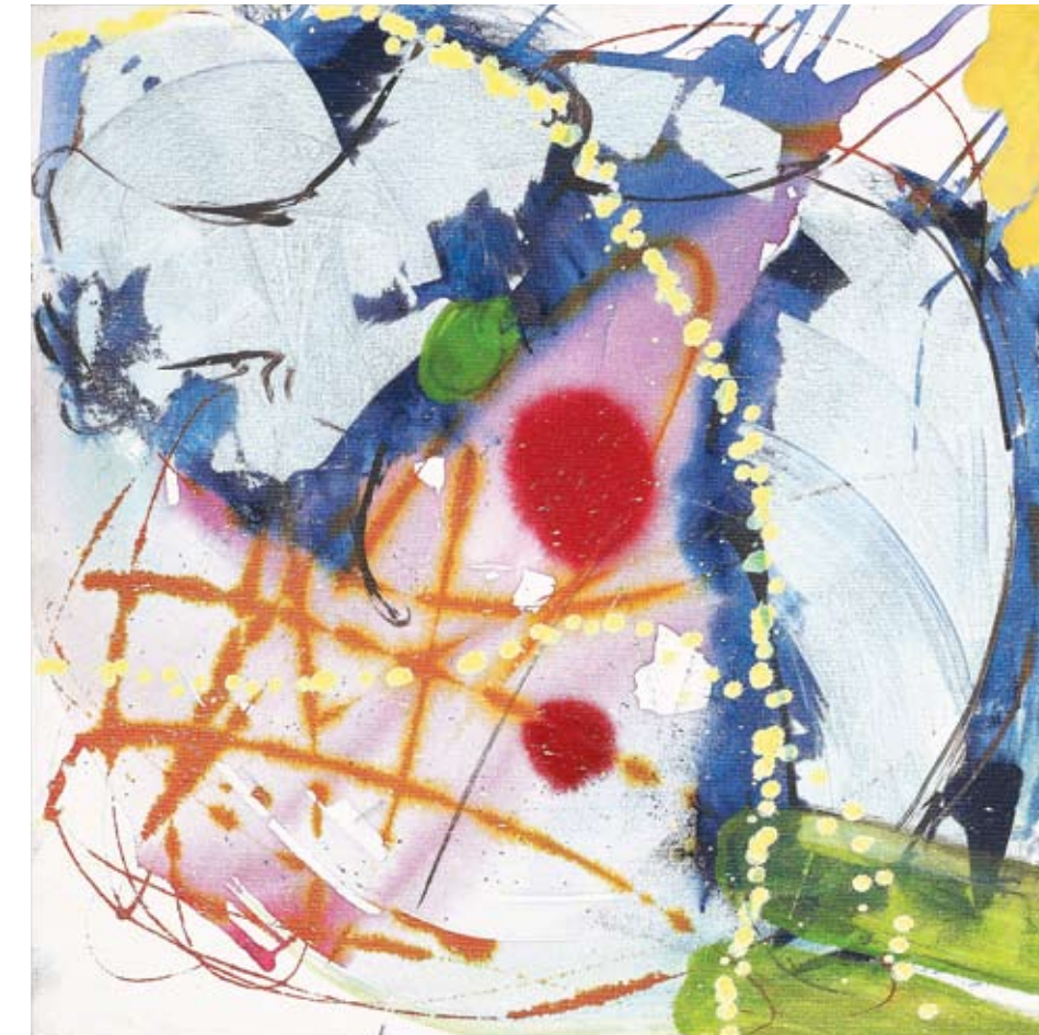
This evening on the radio an exceptionally abstract program mixed media on canvas 90 x 90 cm 2009

How do your paintings age? Very well indeed, thank you. Keep them, live with them and you will see.