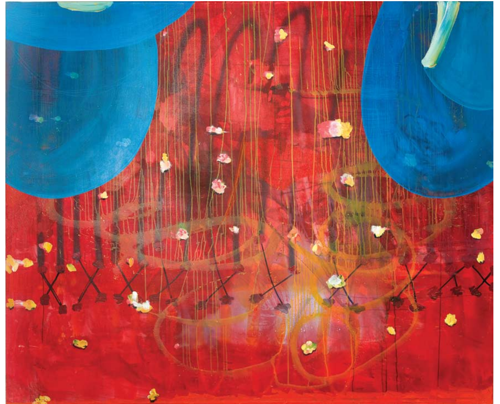
In my studio near Shakespeare's Globe - To grasp or not to grasp at all or to go at it like crazy mixed media on canvas 180 x 220 cm 2009