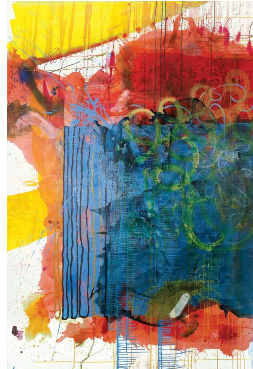
A thing I learned without learning, a hand is a stronger mouth, a kiss could crack a skull mixed media on canvas 270 x 180 cm 2009